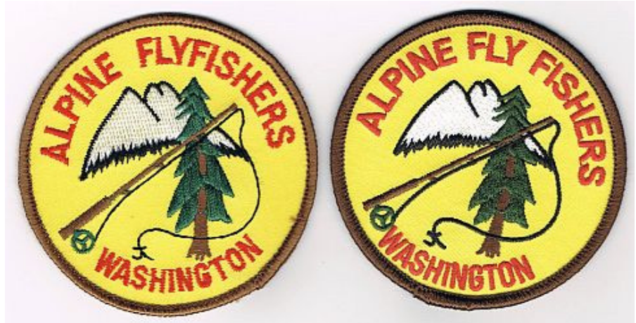
The original AFF Patch