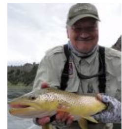
21.5 inch Brown on the MO