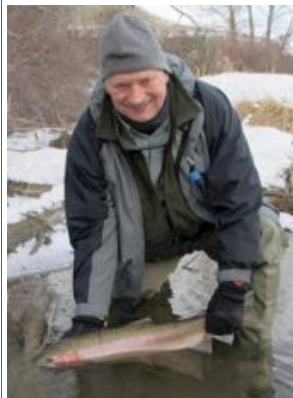
Yakima River Steelhead