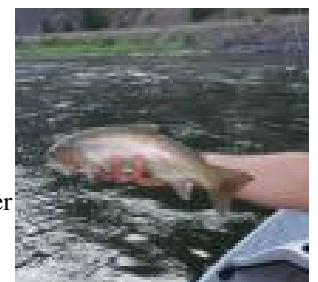
Clark Fork River Rainbow