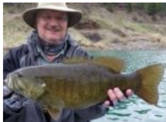
20 inch Smallmouth on the Flathead

Had good times in Montana on the Clark Fork River, the Missouri River, the Flathead River and in Washington on the Yakima River.