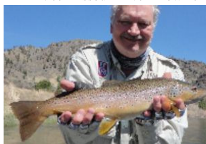
Nice Missouri River Brownie