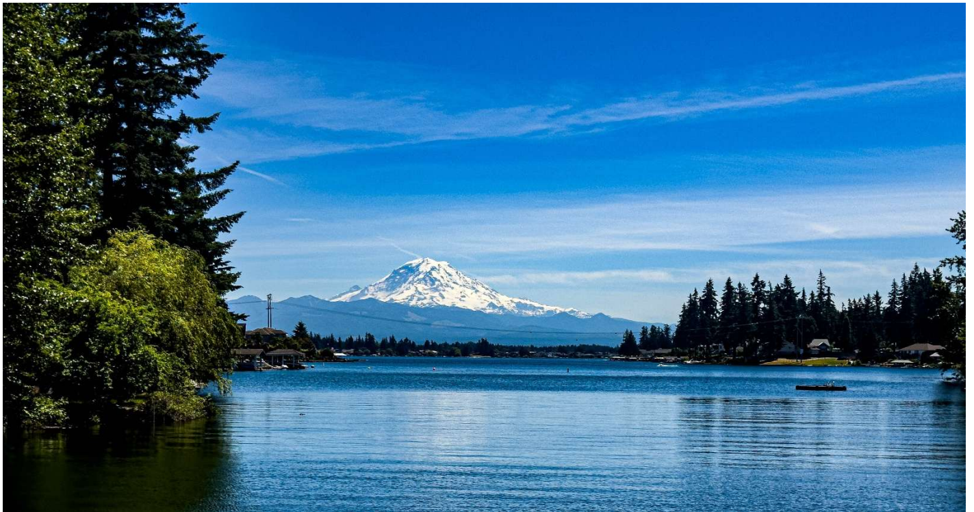
Mount Rainer from Lake Tapps, WA