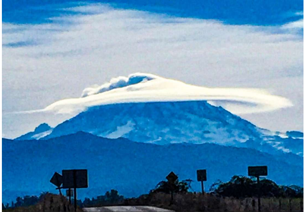
Mount Rainer wearing a Cloud Sunshade – Near Buckley, WA

The Cascades are forty million years old. Interspaced within the mountain range are four-thousand volcanic vents. There are also ghost volcanoes that are located around the current twenty major volcanoes. Of the twenty major volcanoes are fourteen whose names are recognizable to those of us who live in the area from Southwest British Columbia to Northern California.